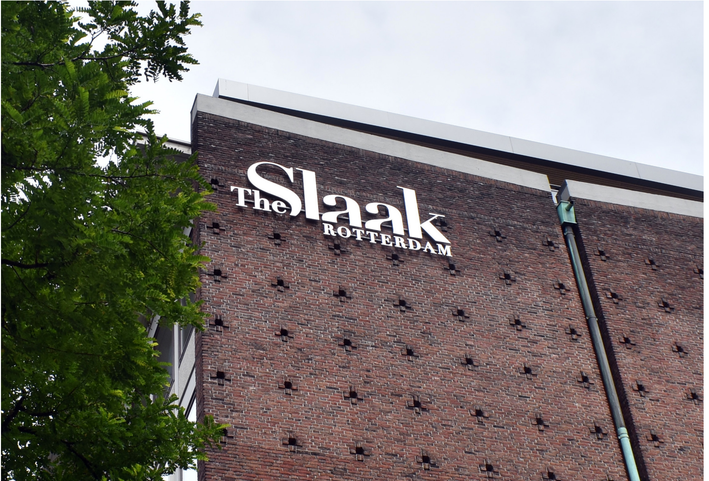
Hotel The Slaak - Slaakhuys in Rotterdam